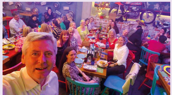
Catch up with Nurses and Board Members