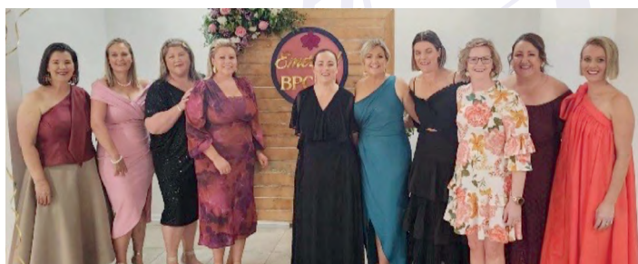
Emerald Committee Members 2023

The gala welcomed nearly 300 guests to the Emerald Town Hall who came together to support a noble cause. The evening was a resounding success, not only in marking two decades of tireless dedication but also in terms of fundraising. Thanks to the incredible generosity of our supporters and attendees, we were able to surpass our previous fundraising records.