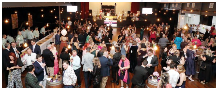
20th Annual Fundraising Dinner

In a remarkable milestone, the Emerald committee recently celebrated its 20th year of unwavering commitment. The crowning jewel of this journey was undoubtedly the 20th Annual Fundraising Gala Ball, an event that surpassed all expectations.